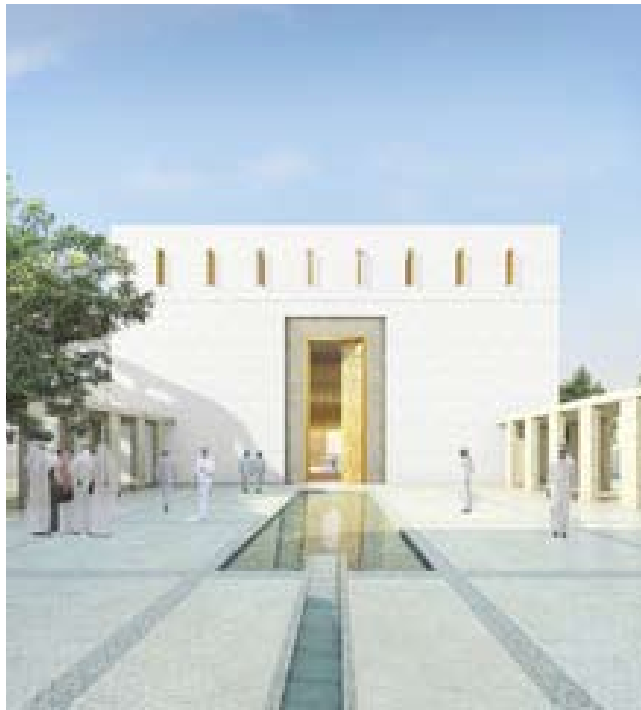
Daily mosque prayer room (below) and interior courtyard (right)