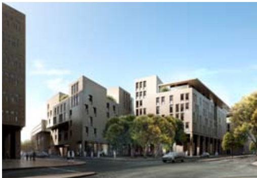
Clockwise from left - serviced apartments, view of hotel from Al Barahat, hotel courtyard

The environmental/climatic characteristics of the site have informed the orientation of building and the design of internal/external spaces, and the building fabric.